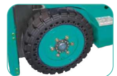
HIGH QUALITY SOLID TYRES