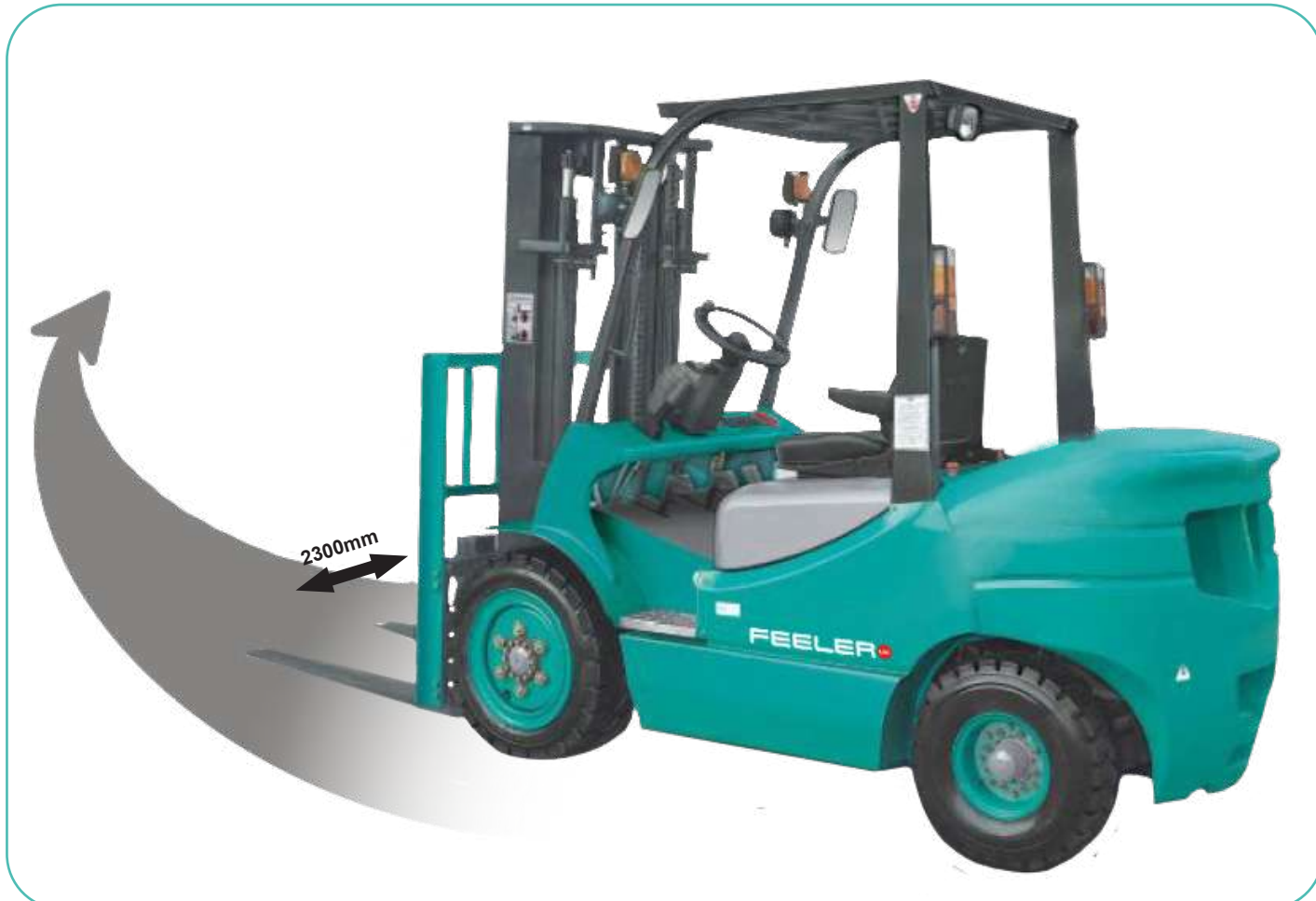
TIGHT TURNING RADIUS