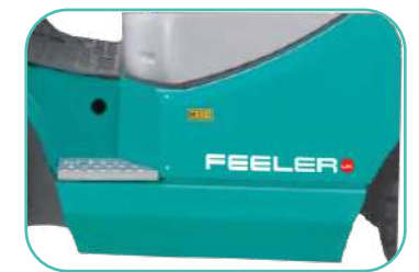
NON-SLIP FOOT PLATES

LOW CENTRE OF GRAVITY WE HAVE SPECIFICALLY DESIGNED OUR TRUCKS TO HAVE A LOW CENTRE OF GRAVITY MAKING EACH TRUCK MORE STABLE AND SAFER WHEN TRAVELLING.