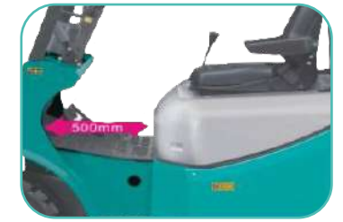
SPACIOUSLY DESIGNED OPERATORS CAB WITH 500MM OF LEG SPACE