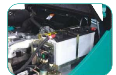
HIGH QUALITY BATTERY