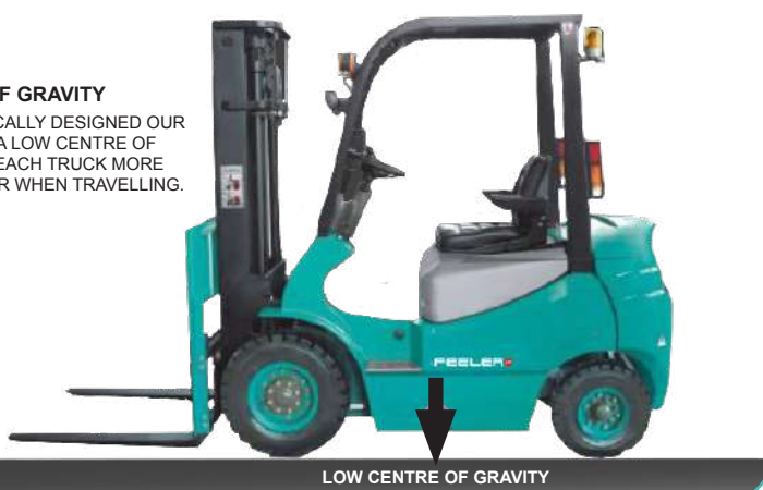
LOW CENTRE OF GRAVITY

LOW CENTRE OF GRAVITY WE HAVE SPECIFICALLY DESIGNED OUR TRUCKS TO HAVE A LOW CENTRE OF GRAVITY MAKING EACH TRUCK MORE STABLE AND SAFER WHEN TRAVELLING.