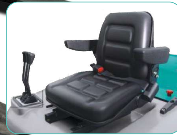
WIDER & MORE COMFORTABLE SEAT OPTIONS